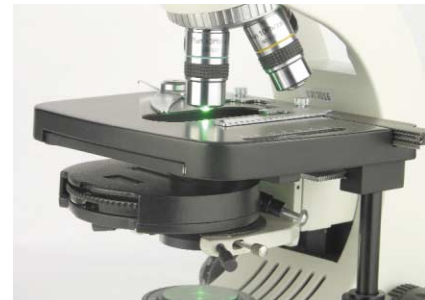
Turret Phase Contrast Condenser