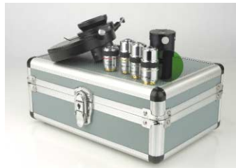
IP750 Plan Phase Contrast Set